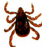
Brown Dog Tick Rhipicephalus sanguineus An indoor species. It can survive outdoors during the summer.