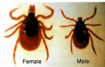
Black legged Tick (enlarged to show detail)

Note: Seventy percent or more of all Lyme disease cases occur from the bite of ticks in the nymph stage.