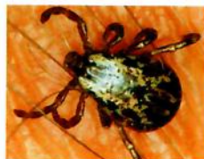
American Dog Tick Dermacentor variabilis (Vector of Rocky Mountain Spotted Fever) The largest tick found in New Jersey. Solid brown with mottled white dorsal shield. Oblong in shape.