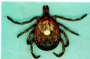
Lone Star Tick Amblyomma americanum (Vector of "Lyme-like" disease; H.M. Ehrlichiosis) Common south of Freehold, New Jersey. Very fast and aggressive. Red brown in color, tear drop shaped.

(greatly enlarged drawings of adult females)